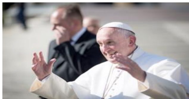
Pope Francis demonstrates size of fish he caught in the Tiber, but no-one believes him.