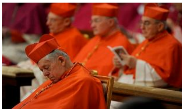
A Cardinal falls asleep during Papal Homily, 'Friends' move him in front of Communion Rail so that the Pope notices.